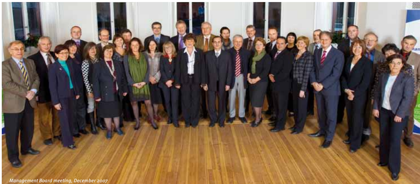
Management Board meeting, December 2007