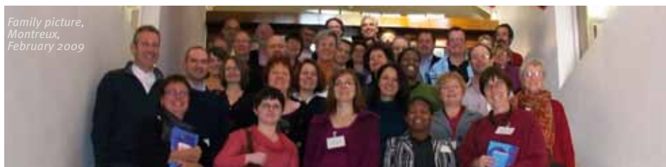
Family picture, Montreux, February 2009

Behavioural surveillance related to HIV and STI in Europe is at the heart of an ambitious project that ECDC has conferred to the Institute for Social and Preventive Medicine, Lausanne (Switzerland). This project aims at mapping behavioural surveillance and surveys in Member States as well as developing