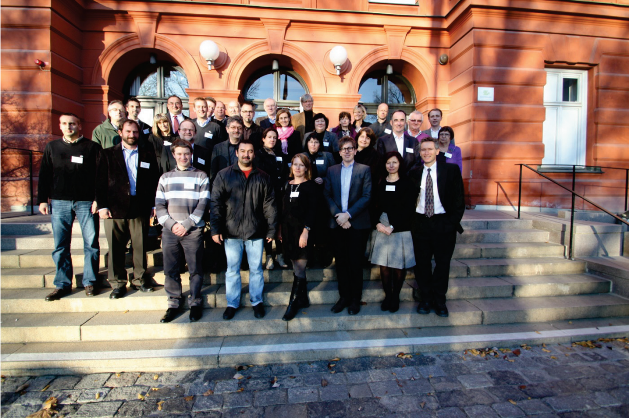
Outside ECDC, Stockholm, November 2011