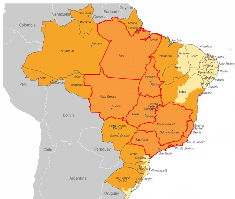
Confirmed cases of locally-acquired yellow fever, as of 16 January 2018