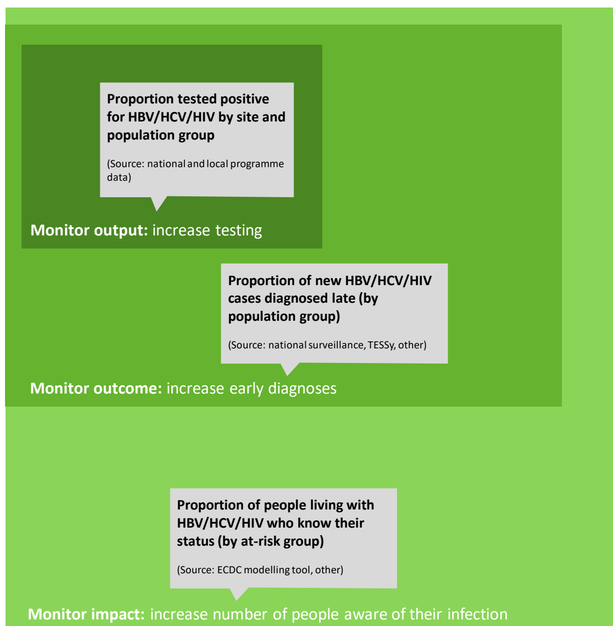
Figure 4. Monitoring and evaluation of testing programmes

The expert consultation also developed key recommendations on the metrics and data sources to use in monitoring testing, including four key metrics for monitoring and evaluation: