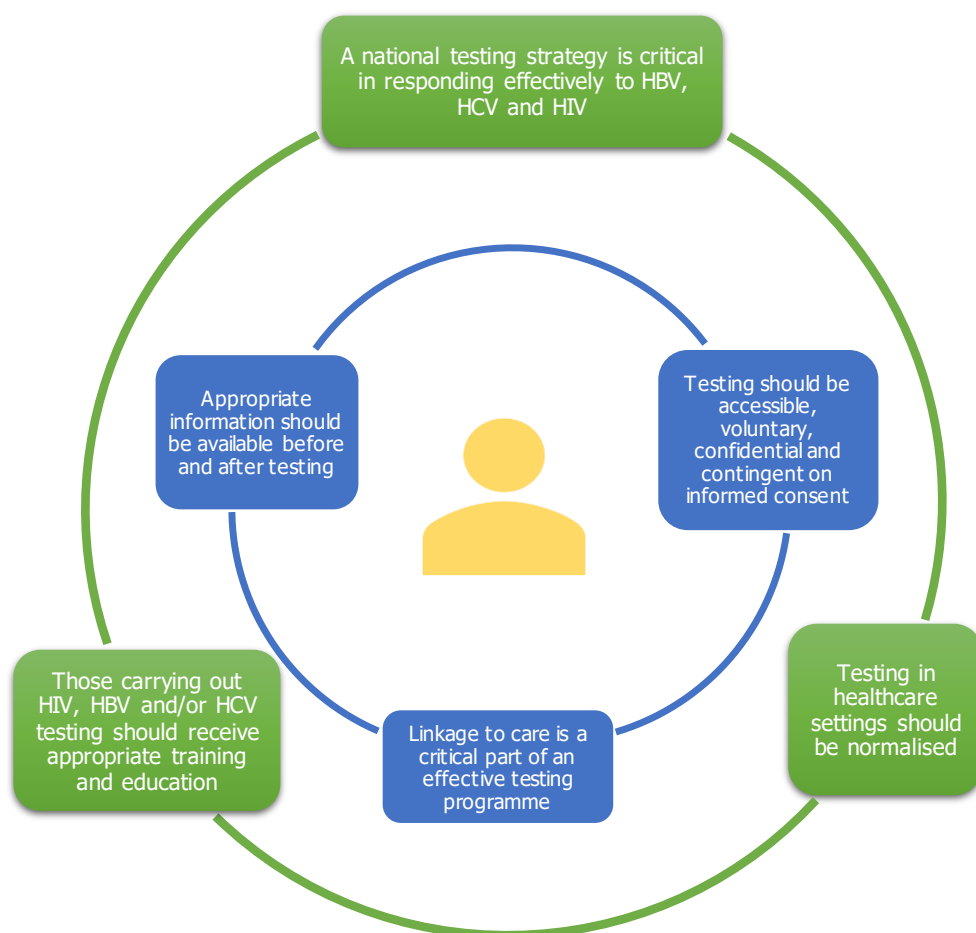
Figure 1. Core principles of integrated testing of HBV, HCV and HIV