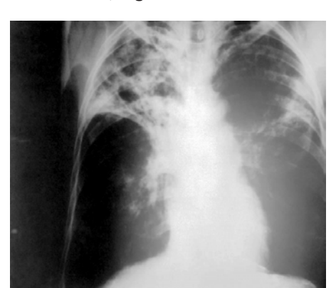
X-ray of advanced bilateral pulmonary tuberculosis

reported at least one XDR-TB case, a highly resistant form of the disease. Furthermore, high levels of the disease