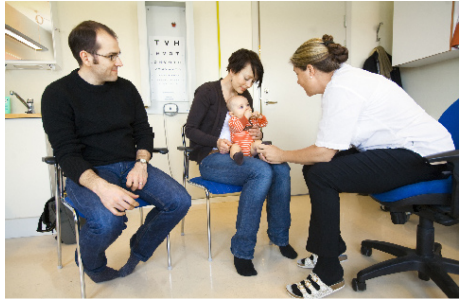
Parents talk to healthcare professional about vaccinating their child, Stockholm, Sweden 2008

To mark European Immunization Week (21-27 April 2008), the scientific journal Eurosurveillance, published by ECDC, ran a special issue on immunization, with several articles looking at the measles situation in Europe. ECDC also published a European Immunization Week package on its website, which included