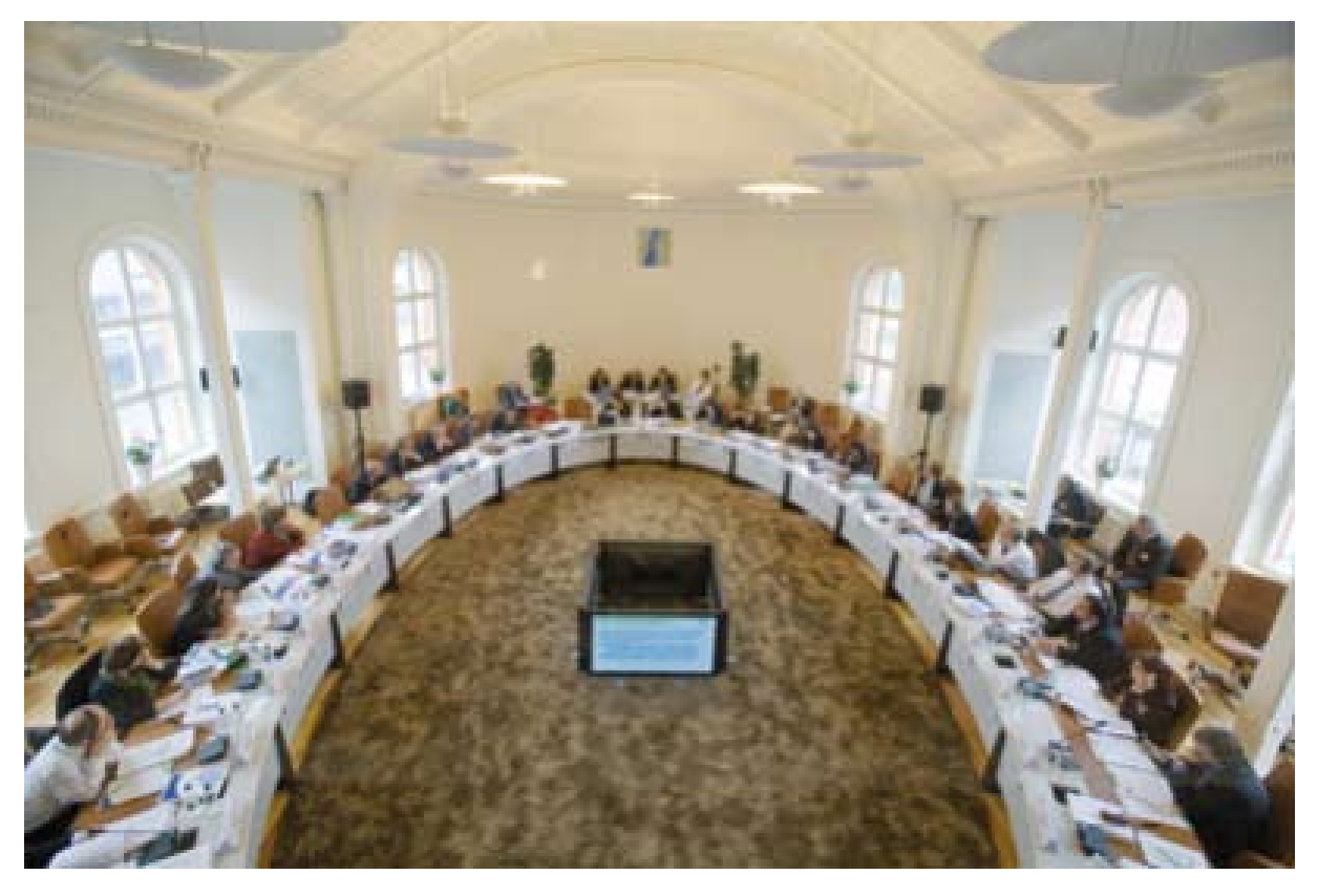
Meeting of Management Board at ECDC.

The Director adopted a publications programme in April. That same month ECDC published the first version of its corporate brochure. The Director's First Annual Report was published in June and distributed to the EU Institutions, the Management Board and other key stakeholders. ECDC also published an Executive Summary of the Director's First Annual Report, ten Technical Reports and four Meeting Reports.