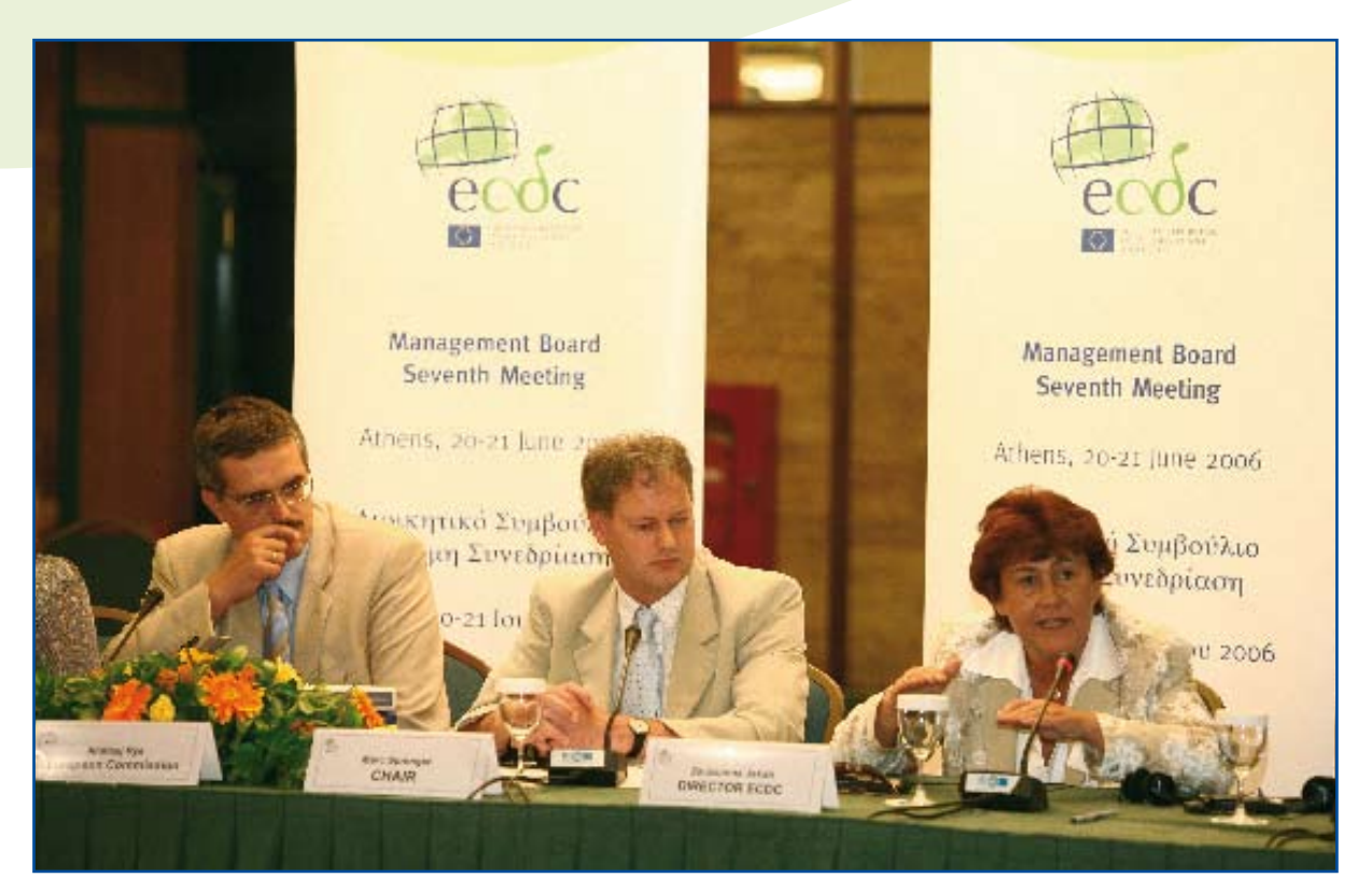
Press conference at ECDC's Management Board Seventh Meeting held in Athens, 20 and 21 June 2006.

formal Council meeting in February in Vienna. As the mandate of ECDC borders those of several other EU agencies, several meetings have taken place to discuss joint issues with the European Food Safety Authority (EFSA), the European Agency for the Evaluation of Medicinal Products (EMEA), the European Environmental Agency (EEA) and the European Monitoring Centre for Drugs and Drug Addiction (EMCDDA).