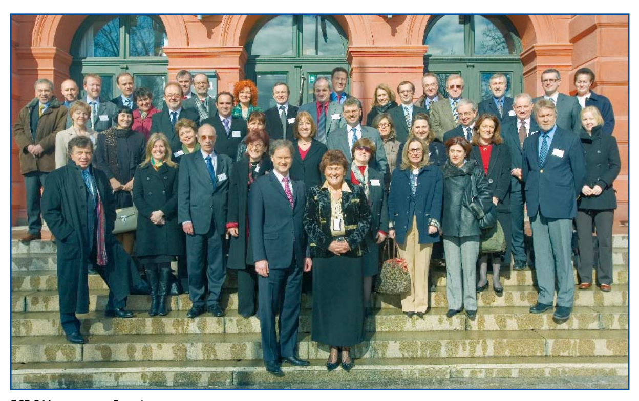
ECDC Management Board.