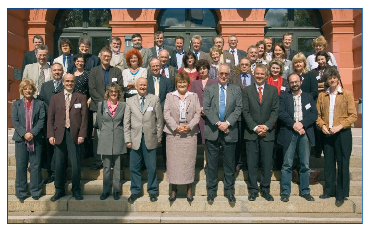
ECDC Advisory Forum.