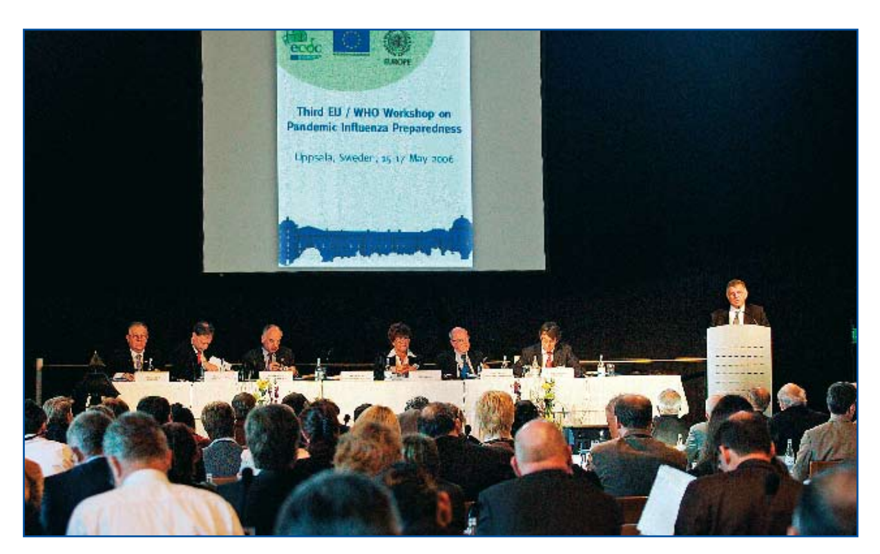
Third EU/WHO Workshop on Pandemic Influenza Preparedness, Uppsala, Sweden, 15-17 May 2006

Fifteen EU countries had been assessed by the end of 2006 (Austria, Belgium, the Czech Republic, France, Germany, Greece, Hungary, Italy, Latvia, Lithuania, Poland, Portugal, Slovakia, Spain and the United Kingdom), and in addition ECDC has worked with WHO on the assessment of another three neighbourhood countries (Kazakhstan, Turkey and Ukraine). Twelve of these country missions took place in 2006. The assessments drew on staff from across ECDC as well as increasingly from the Member States that had participated in previous assessments. The assessment tool and procedure were considerably improved for the autumn assessments following a mid-year review. Greater emphasis was put on the joint nature of the assessments between ECDC and the Member State being assessed, with more