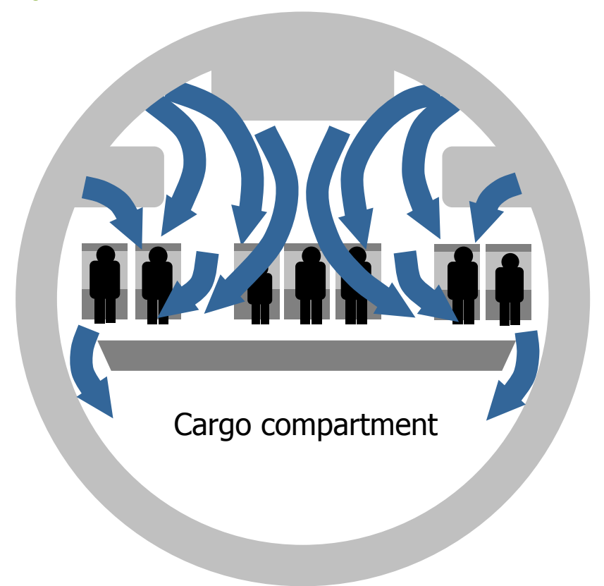
Figure 2. Cabin airflow