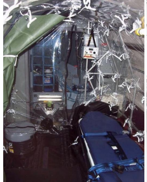
Figure 1. Open isolation approach: mobile isolation unit 'Aeromedical Biological Containment System – ABCS' as used by Phoenix Air

Upon arrival, the patient is moved out following the reverse order: before leaving the mobile isolation unit, the patient is provided with a fresh FFP respirator and body cover. The receiving transport team (ambulance) is taking over the stretcher outside the mobile isolation unit and carries it to the ambulance. Again, the distance between the isolation unit and the aircraft door is disinfected. The inflight medical staff decontaminate and take off their PPE in the airlock anteroom, helping each other. Finally, the isolation unit is decontaminated on the inside and detached from the support frame. Afterwards, the liner is removed from the aircraft and incinerated.