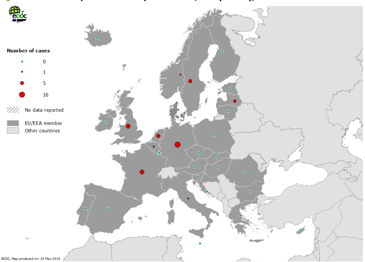
Source: Country reports from Austria, Belgium, Bulgaria, Croatia, Cyprus, the Czech Republic, Estonia, Finland, France, Germany, Greece, Hungary, Iceland, Ireland, Italy, Latvia, Lithuania, Luxembourg, Malta, the Netherlands, Norway, Poland, Portugal, Romania, Slovakia, Slovenia, Spain, Sweden and the United Kingdom.