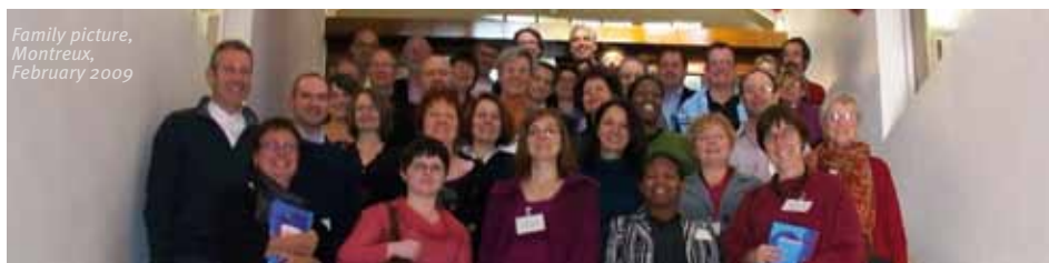
Family picture, Montreux, February 2009

Behavioural surveillance related to HIV and STI in Europe is at the heart of an ambitious project that ECDC has conferred to the Institute for Social and Preventive Medicine, Lausanne (Switzerland). This project aims at mapping behavioural surveillance and surveys in Member States as well as developing