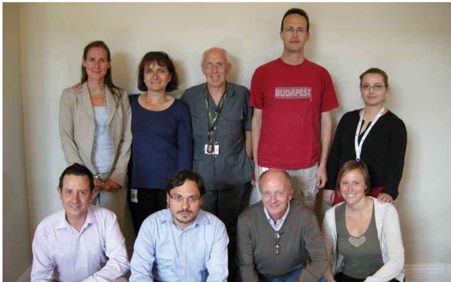
Some of the Team that works on ECDC's Influenza Programme