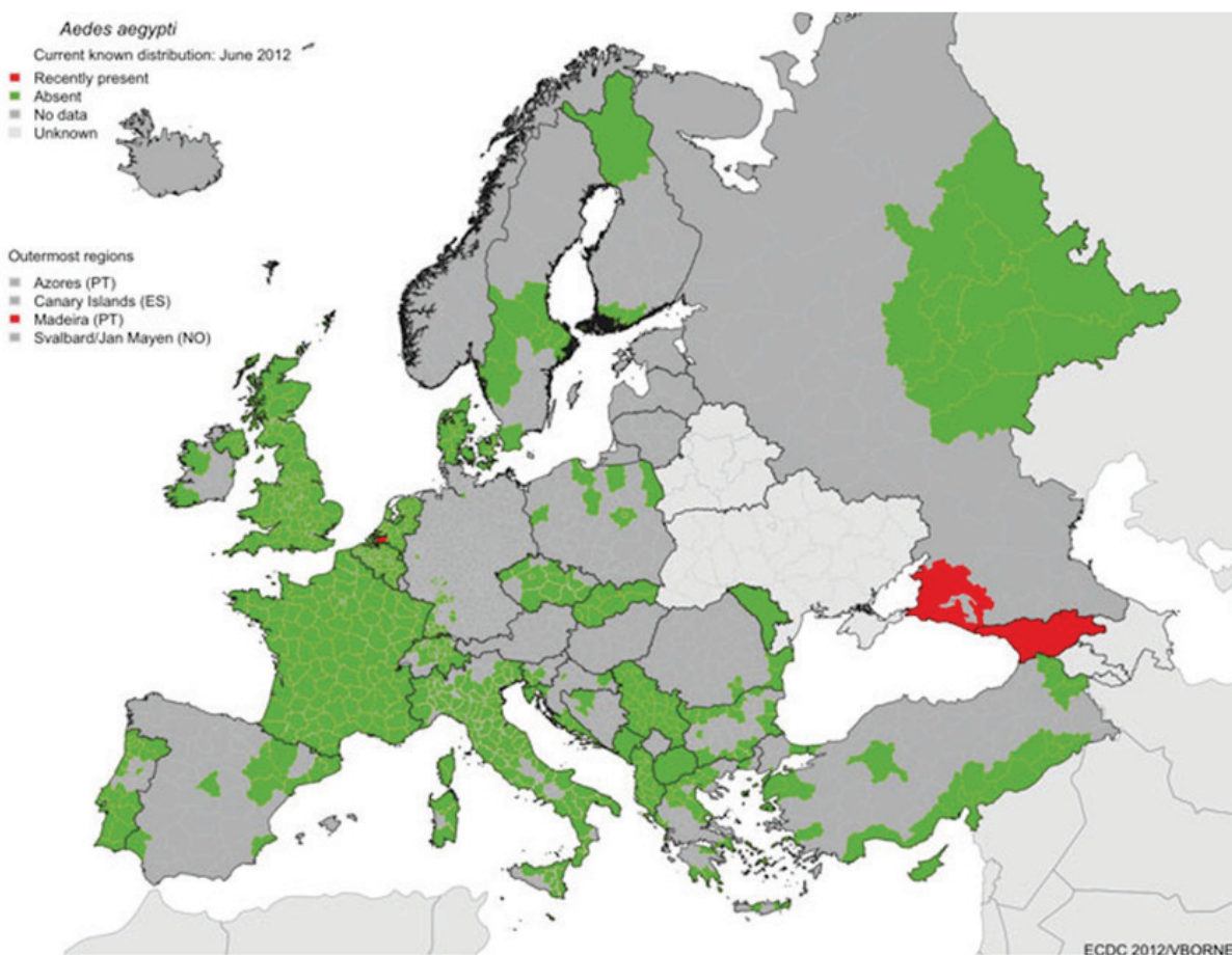
Figure 1. Distribution of Aedes aegypti in Europe, June 2012